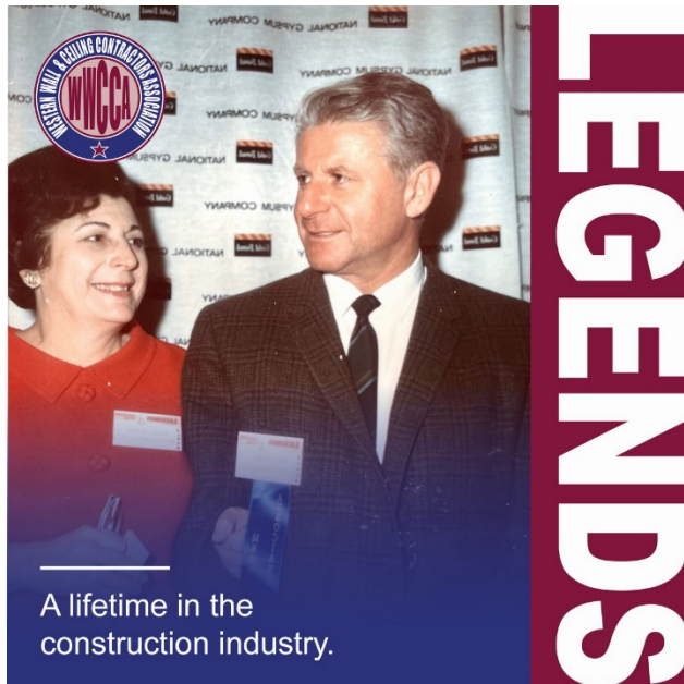
A lifetime in the construction industry.

Nathan Kimmel Company, LLC, has grown from a go-to resource for drywall and plastering contractors in Los Angeles to become a provider of construction equipment, NKC Injection Systems, industrial supplies, and tarps to the wall and ceiling industry, locally, nationally, and internationally.